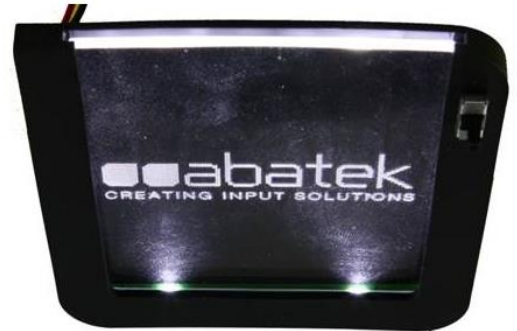
Demo sample Light Guide Silicone

Silicone light guides or thin sheets enable good homogeneous lighting with fewer LED's and allow special effects. Thermally stable with a light transmission >92%.