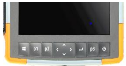
HMI in gapless Polyform below screen

Can be made from self healing material for rough environments.