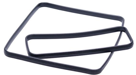
Display seals for different sizes