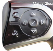
Gloss / Matt